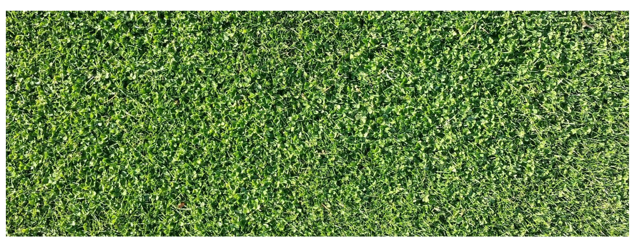
Successful overseeding of pure grass with Microclover®

The "spoon feeding" of the grasses with nitrogen from Microclover® secures a nice and more even growth of the grasses in the mixture. The vital growth keeps the grasses healthy and free of diseases.